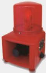
BC-110 Outdoor Siren and Revolving Light