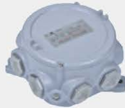
BHD91 Series Explosion-proof Junction Boxes