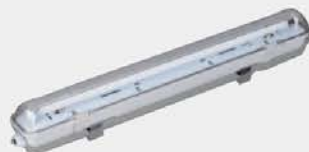
FH5228T Weather Proof Fluorescent Fixture 2x28W