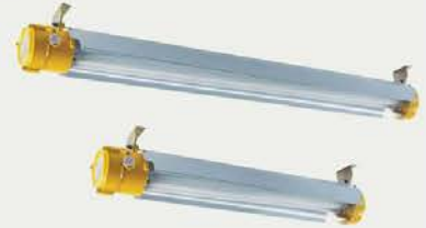
BAY51-D Series Explosion-proof Light Fittings for Fluorescent Lamp