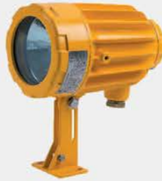
BAK51 Series Explosion-proof Tank Inspection Vessel Light Fittings