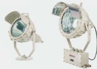
BTd92 Series Explosion Proof Floodlights (IIB, IIC, tD)