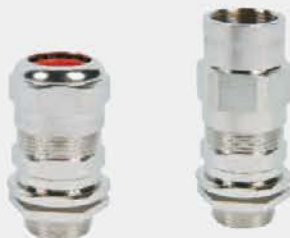
DQM-I Series Explosion-proof Cable Glands Metal Armored