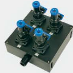
BXS8030 Series Explosion Proof Corrosion Resistance Receptacle Panels (IIC, tD)