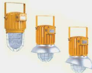
HRD91 Series Explosion-Proof Light Fittings