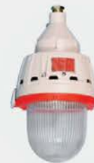
BZD128 Series Explosion Proof LED Light Fittings (IIC, tD)