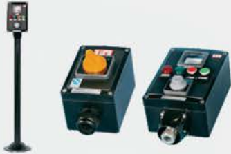
LCZ8030 Series Explosion Proof Corrosion Resistance Control Station (IIC, tD)