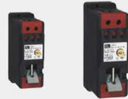
CZ0511 Explosion-proof creep age breakers module