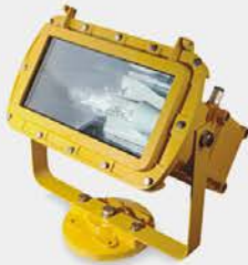
RFB720 Explosion Proof Glare Floodlight Outfield Light