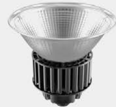
SHX-GK-L-150 LED High Bay Light