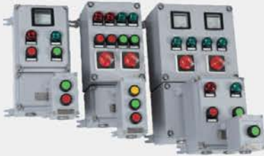
BZC8050 Series Control Stations (Aluminium Alloy)