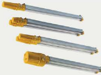
BAY51 Series Explosion-proof Light Fittings Fluorescent Lamp