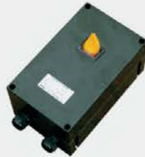
BDZ8030 Series Explosion Proof Corrosion Resistance Circuit Breakers (IIC, tD)