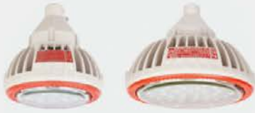
BZD118 Series Explosion Proof LED Light Fittings (IIC, tD)