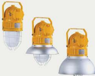
BDD91 Series Explosion-proof Light Fittings