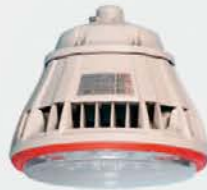
BZD126 Series Explosion Proof LED Light Fittings (nR, tD)