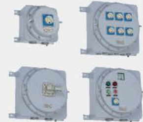
BLK Series Explosion-proof Motor Switches (Ex d IIC)