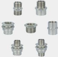
BGJ Series Explosion-proof Connectors