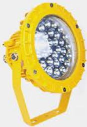
RFBL154 Explosion Proof Platform Light