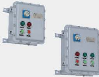
BQD Series Explosion-proof Motor Starters