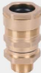
DQM-II Series Explosion-proof Cable Glands Armored Dual Seal (Cold Flow)