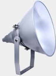
RGT621 Projector Light