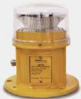
LM101 Medium Intensity Aviation Obstruction Light