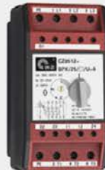
CZ0512 Explosion-proof motor protection switches module