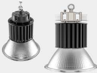
SHX GKL LED High Bay Light