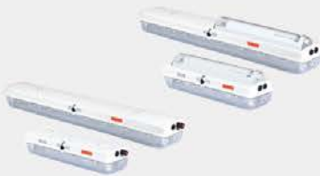
CZ0875 Full Plastic Exploision-proof Fluorescent LED Light Fittings