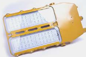
RFBL166 Explosion Proof Street Light