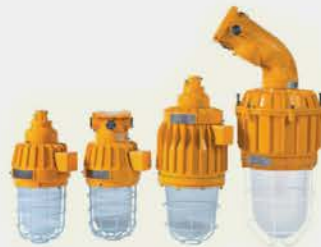
HRD61 Series Explosion-Proof Light Fittings