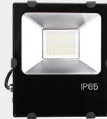
SHX TGA LED Flood Light