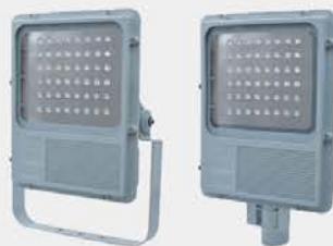
CZ0878n LED Explosion-proof floodlight light fittings