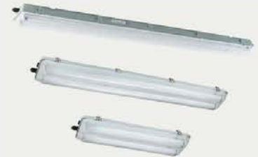
BnY81 Series Explosion-proof Light Fittings For Fluorescent Lamp