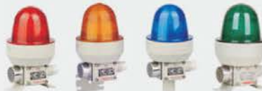
BBJ Series Explosion Proof Audible and Visual Alarm (IIC,tD)