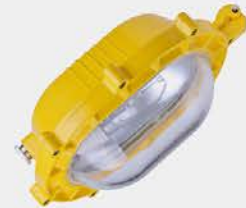
RFB712 Glare Explosion Proof Light Infield