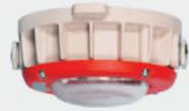
BZD131 Series Explosion Proof LED Light Fittings (IIC, tD)