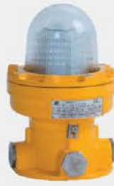
BJD81 Series Explosion-proof Caution Spotlight Fittings