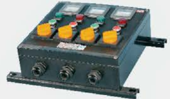
ZXF8044 Series Explosion Proof Corrosion Resistance Control Panels (IIC, tD)