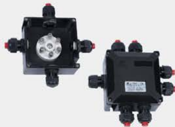
BXJ8050-206 Series Junction Boxes