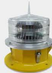
LM100 Medium Intensity Aviation Obstruction Light