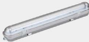
FH9236T Weather Proof Fluorescent Fixture 2x36W