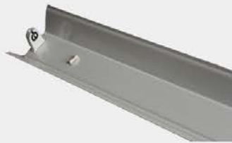
Fluorescent Power Coat