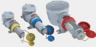
BCZ85 Series Explosion-proof Plug and Sockets