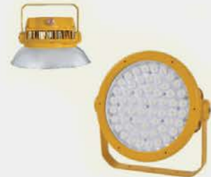
HRND95 Series Explosion-proof LED Lightings