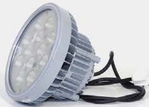
BC9303 Explosion Proof LED High Bay Light