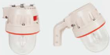
BZD121 Series Explosion Proof LED Light Fittings (IIC, tD)