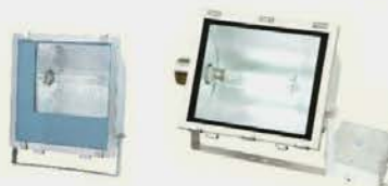
HRT81 Series Explosion-proof Floodlights