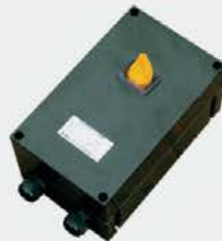
BDB8030 Series Explosion Proof Corrosion Resistance Motos Protectors (IIC, tD)