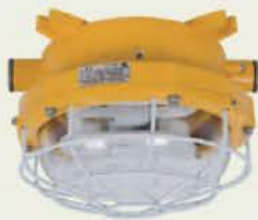
BAY-H Series Explosion-proof Annular Light Fittings for Fluorescent Lamp