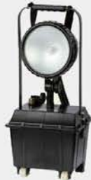
HRD-502A Strong Working Light