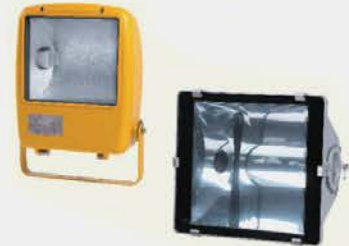
BnT81 Series Explosion-Proof Floodlights