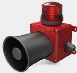
AL310 Series Beacon Siren