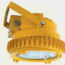
BDD96 Series Explosion-proof LED Lightings