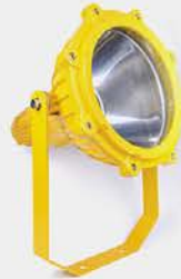
RFB717 Explosion Proof Projector Light