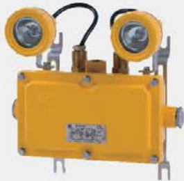
BAJ52-20 Series Explosion-proof Emergency Light Fittings