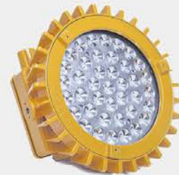
RFBL165 Explosion proof platform