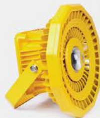
RFBL105 Explosion Proof Platform Light