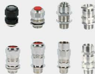
Explosion Proof Cable Glands