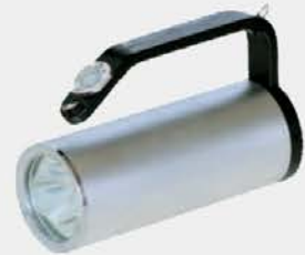
HRD306 Portable Searchlight