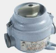
BZM Series Explosion-proof Illumination Switches