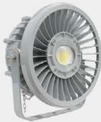
BC9700 Explosion Proof LED Platform Light