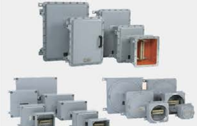
BXJ Series Explosion-proof Terminal Boxes