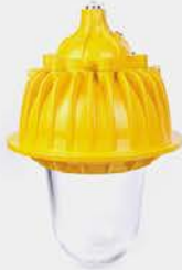
RFB715 Explosion Proof Highbay Light