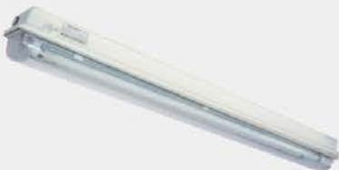
BYD 703 Series Explosion Proof Corrosion Resistance Polyester Fluorescent Light Fittings