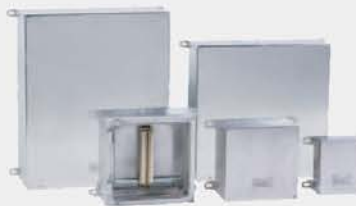
BXJ-S Series Terminal Boxes