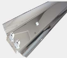
Mirrored 2x36 2x28