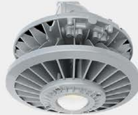
BC9306 Explosion Proof LED Platform Light