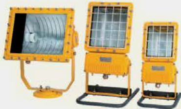
BAT53 Series Explosion-Proof Floodlights