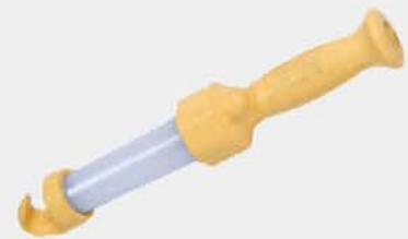
HRD3180 Explosion-proof LED Hand Lamps