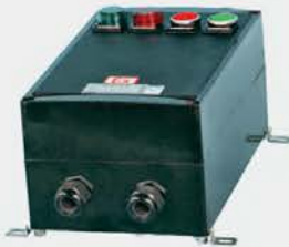
BQC8030 Series Explosion Proof Corrosion Resistance Electromagnetic Starters (IIC, tD)