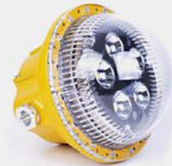
RFBL156 Explosion Proof Pendant Light