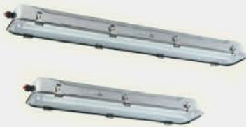
BAY51-G Series Explosion-proof Light Fittings for Fluorescent Lamp