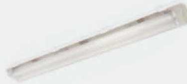
BYS Series Explosion Proof Corrosion Resistance Polyester Fluorescent Light Fittings (IIC, tD)