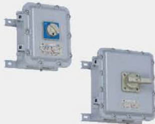
BLK Series Explosion-proof Motor Switches (Ex d IIB)