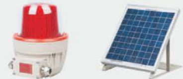
RHD950 Series Explosion Proof Aviation Obstruction Beacons (IIC, tD)