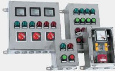
BZC8050 Series Control Stations (Stainless Steel)