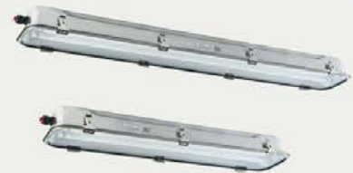
BJY Series Explosion-proof Lustration Light Fittings For Fluorescent Lamp