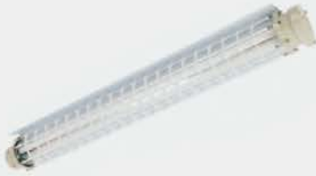
BPY Series Explosion Proof Fluorescent (IIB, tD)