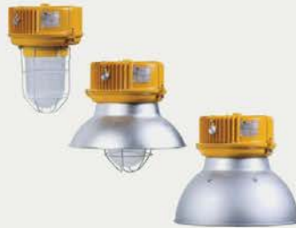
BnD81 series Exploision-proof Light Fittings