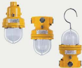
BDD81 Series Explosion-proof Lightings