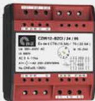
CZ0512 Explosion-proof magnetic module (AC contactor+thermorelay)