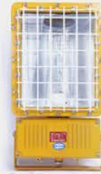
RFB718 Explosion Proof Flood Light