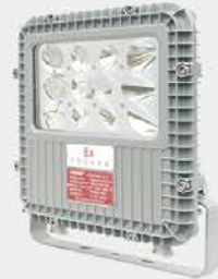
BC9101 Explosion Proof LED Flood Light