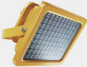
Defender Flood Light Explosion Proof