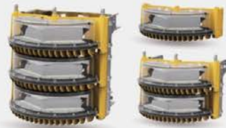
LH88 High Intensity Aviation Obstruction Light