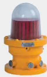
BSZD81-E Series Explosion-proof Caution Spotlight Fittings