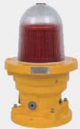
BSZD81-C Series Explosion-proof Caution Spotlight Fittings