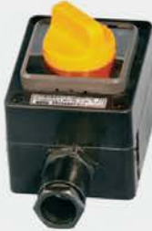
ZXF8030/51 Series Explosion Proof Corrosion Resistance Switch (IIC, tD)