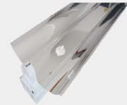
Fluorescent Mirrored 1x36 1x28