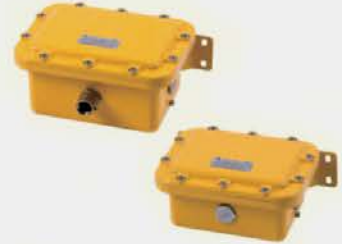
BAZ51 Series Explosio-Proof Ballast