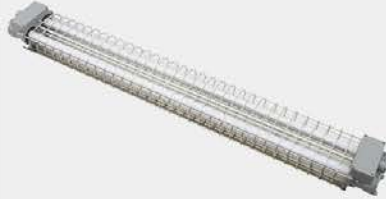
BC5401 Explosion Proof Fluorescent Fixture