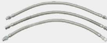
BNG Series Satinless Stell Explosion-proof Flexible Conduits