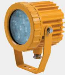
BAK86 Series Explosion-proof LED Tank Inspection Vessel Light Fittings