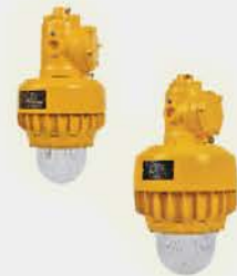
HRD91-LED Series Explosion-proof LED Lightings