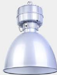
RGH681 High Bay Light