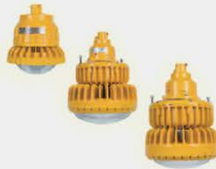
HRD85 Series Explosion-proof LED Lightings