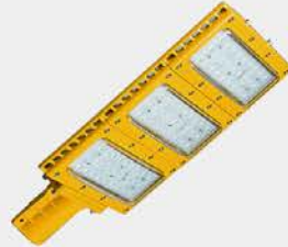
Explosion Proof LED Street Light