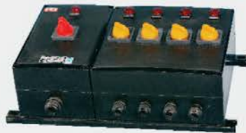
BXM(D)8030 Series Explosion Proof Corrosion Resistance Illumination (Power) Distribution Panels (IIC, tD)