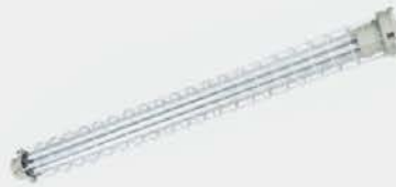
BPY96 Series Explosion Proof Platform Light Fluorescent Light Fittings (IIC,tD)