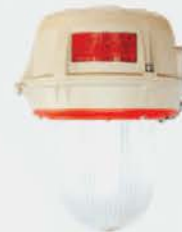
BZD125 Series Explosion Proof LED Light Fittings (nR, tD)