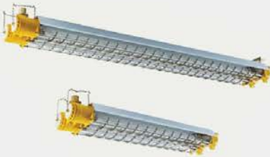
HRY52 Series Explosion-proof Light Fittings For Fluorescent Lamp