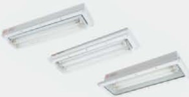
CZ0361 Ex lighting