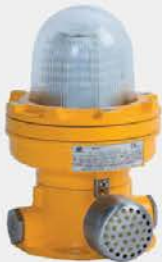
BBJ81 Series Explosion-proof Audio and Visual Caution Spotlight Fittings