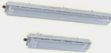
BAY51-Q LED Series Explosion-proof Light Fittings for Fluorescent Lamp