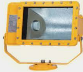
BAT85 Series Explosion-proof Floodlights