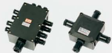
BDZ8030 Series Explosion Proof Corrosion Resistance Junction Boxes (e, tD)