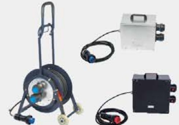
BCZY Series Explosion-proof Movable Switchboards