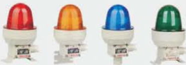
BJD96 Series Explosion Proof Alarm Light Fittings (IIC, tD)