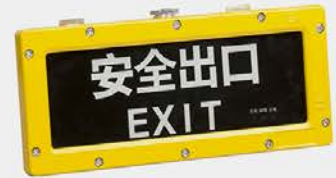
RFBL Explosion Proof Exit Signs