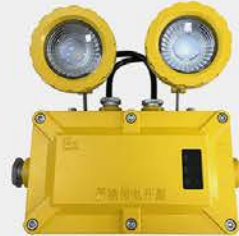
RFBJ Explosion Proof Emergency Light