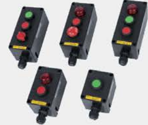
BZA8050 Series Explosion-proof Control Unit Systems