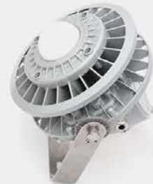
BC9307S Explosion Proof LED Platform Light