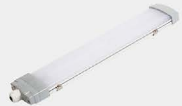
RFBL121 Explosion Proof LED Fluorescent Fittings