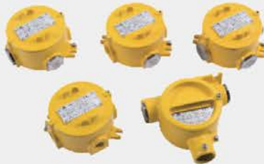
BHD51 Series Explosion-proof Junction Boxes