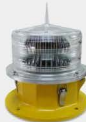
LM401 Medium Intensity Aviation Obstruction Light