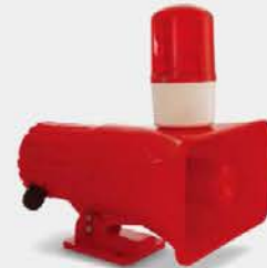
BC-3B Beacon Siren