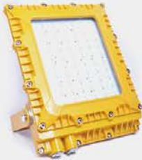
RFBL162 Explosion proof floodlight