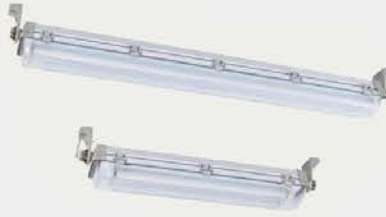
BAY81-QT Series Explosion-proof Fluorescent Lamp For Derrick