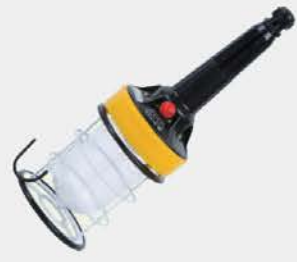
BSX-40 Series Explosion-proof Incandescent Hand Lamps