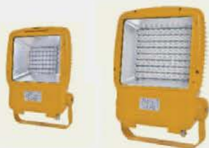
HRNT95 Series Explosion-Proof LED Floodlights