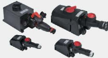
BCZ8060 Series Explosion-proof Plug and Sockets