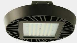
SHX GKY LED High Bay Light