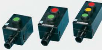
ZXF8030 Series Explosion Proof Corrosion Resistance Control Units (IIC, tD)