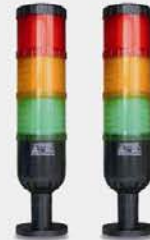
AL203 Multi Layer Beacon Siren