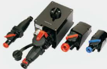
ZXF8575 Series Explosion Proof Corrosion Resistance Plug and Receptacles (IIC, tD)