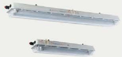
BAY51-Q Series Explosion-proof Light Fittings for Fluorescent Lamp