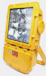
RFB719 Explosion Proof Flood Light