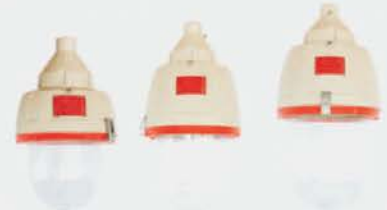
CCd93 Series Explosion Proof Light Fittings (IIC, tD)