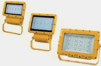
BAT86 Series Explosion-Proof LED Floodlights