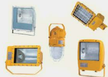
Street Lamps Explosion-Proof Street Lamps