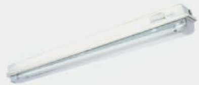
BYD705 Series Explosion Proof Corrosion Resistance Polyester Fluorescent Light Fittings (IIC, tD)