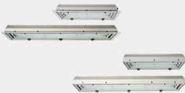
BZD121 Series Explosion Proof LED Light Fittings (IIC, tD)