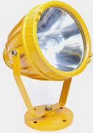
RFB716 Explosion Proof Projector Light