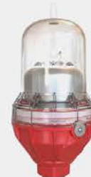
LS810 Low Intensity Aviation Obstruction Light