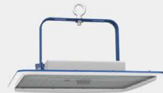
XJ-GSL200W LED Canopy Light